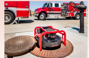
Confined Space Rescue