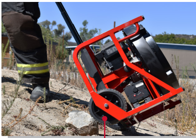
All terrain wheels