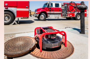
Confined Space Rescue