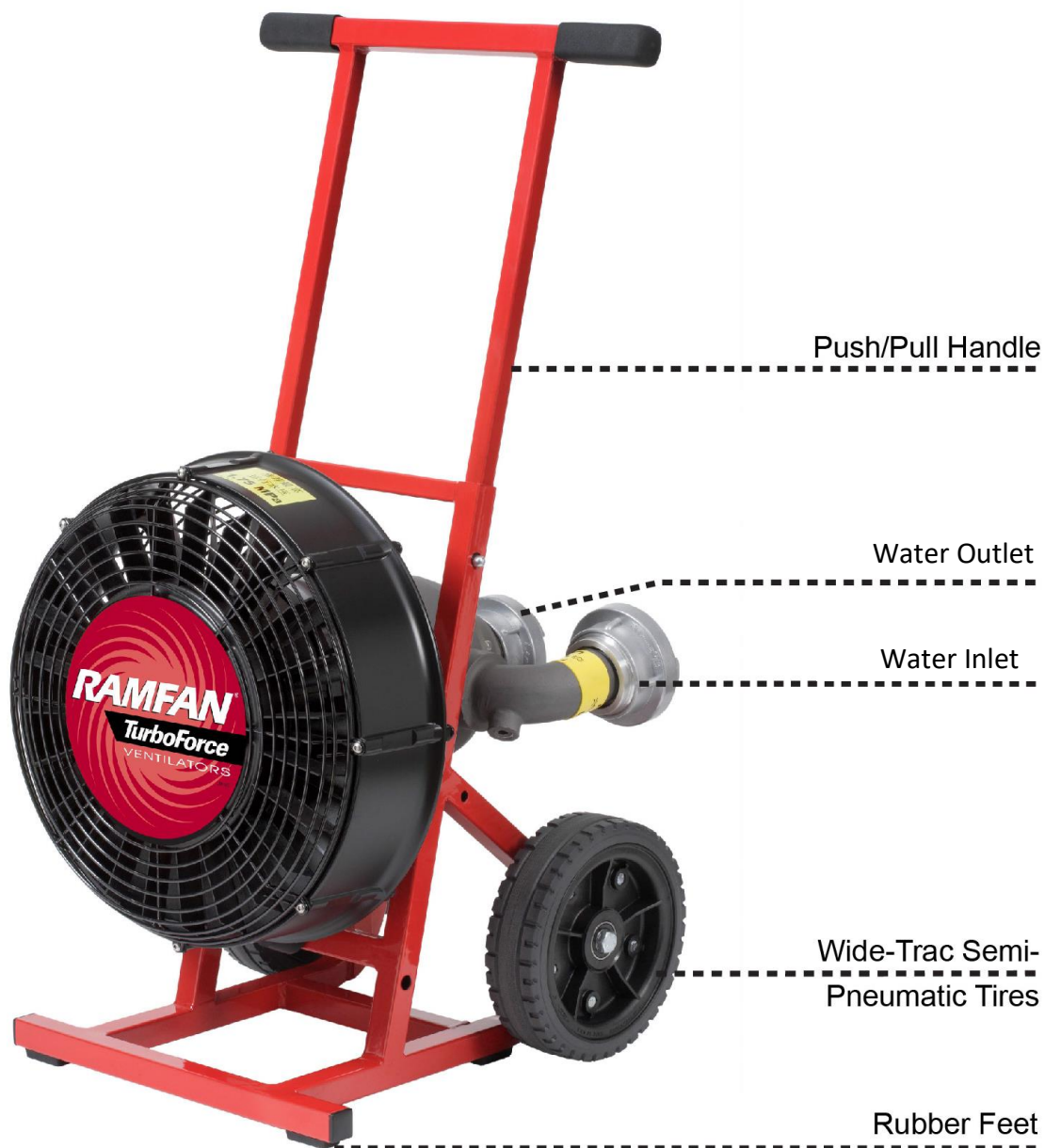
Figure 1- WF390

Refer to Figure 1 below for location of WF390 controls and features.