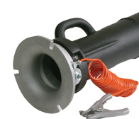
Static Cord Order # AZ-RAC-10